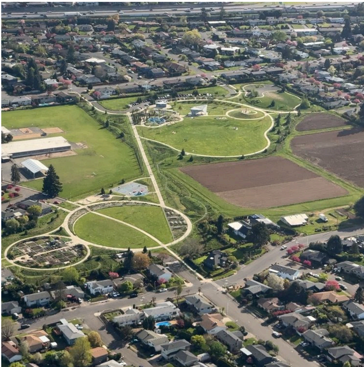
A Luuwit View of a different kind on the way into PDX.