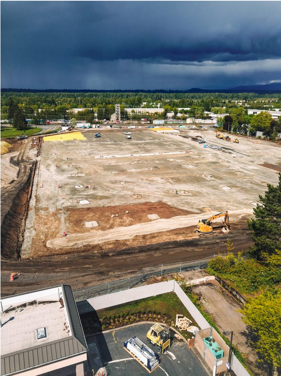
ProLogis construction site as of 4/29/24.